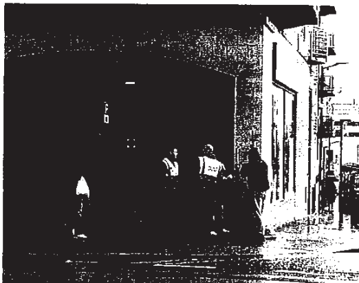
Ambassadors attend altercation amongst street drinkers outside West Street Tesco