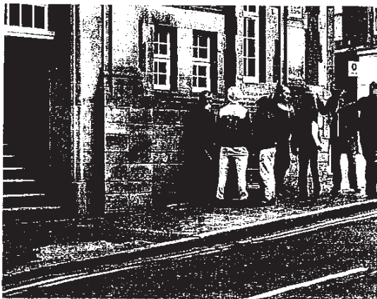
Street drinking group at West Street/Cavendish Street junction (see comments about drug dealing in this area)